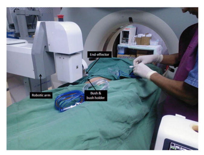
Fig. 2 The robotic arm was positioned automatically to the exact coordinates according to the treatment plan. The bush and bush holder were clamped firmly at the end-effector of the robotic arm before insertion of the RFA needle through the bush

requiring a pre-procedure import and processing of the 3D data to the robot's workstation, which can be a complex and time-consuming procedure. However in our preliminary experience with the Robio<sup>™</sup> EX, we found the overall satisfaction with the performance to be high. Even though the planning did take time, it was found to be intuitive and this